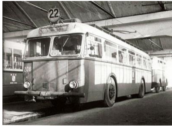
Gdynia trolleybus Henschel nr inw. 206 (1950 r.)

■ The trolleybus system in Gdynia is functioning since 1943 and currently the biggest and the most modern system in Poland.