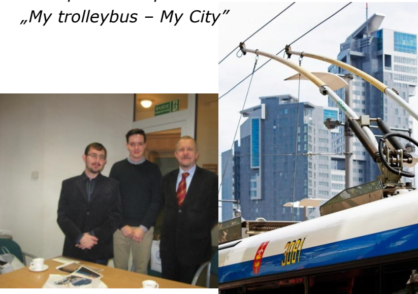
2011 photo competition „My trolleybus – My City”