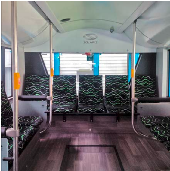
„VIP“ lounge in the rear, placed above traction batteries

Vossloh Kiepe provides the complete electrical traction equipment, the on-board power supply system, the traction batteries and the automatic current collector system.