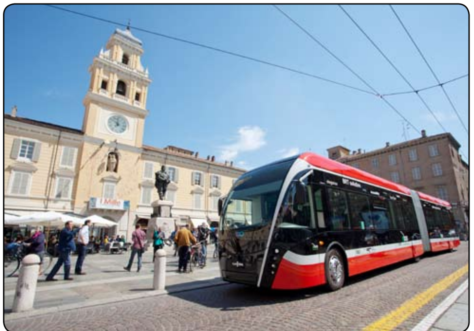
The new "ebus" for Parma

Parma has been using trolleybuses for nearly 60 years. This non-polluting and silent solution is welcome to the city. Recently Tep has chosen 9 new appealing tramlook vehicles produced by VanHool. The new 18 meter long vehicles will be used on line 5, the most used of the city with its 12,000 passengers per day, crossing Parma from East to West. The first of the new trolleybuses was inaugurated on May 4th 2012, during the 16th UITP Trolleybus Working Group meeting, in the presence of local and regional authorities. The new trolleybuses will be equipped with supercapacitors, which are co-funded as pilot investment by the TROLLEY project. This technology allows the recovery