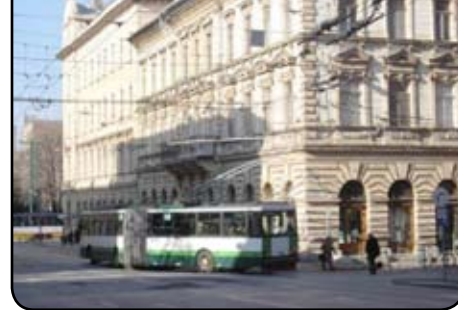
Reconstructed trolleybus junction Híd utca in Szeged

The TROLLEY partner Szeged Transport Company (SZKT) invested in a Trolleybus Corridor that aims at a better, intermodal public transport system in Szeged. Key elements that are funded by the TROLLEY project are the high-speed wires, crossings and switches which ensure a reduced number of trolley derailments as well as reduced vibrations in the neighbouring houses. Furthermore, SZKT reconstructs a trolleybus stop with special kerb elements to provide accessibility to low-floor trolleybuses. For this, SZKT reconstructed the overhead wires at the Híd utca – Vár utca trolleybus junction as well as the Híd utca trolleybus stop as pilot actions in the TROLLEY project. Thereupon, SZKT produced a report, which can serve as a manual for im-