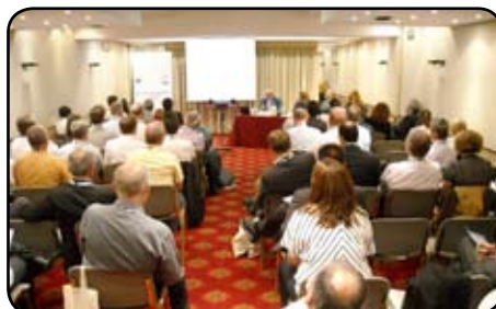
Knowledge Exchange during TROLLEY's & UITP's joint meeting in Parma

UITP Trolleybus Working Group, were followed by an introductory presentation about the TROLLEY project. Afterwards a TROLLEY Roadmap of project activities till the end of 2012 was presented and the UITP Trolleybus Working Group members were invited to make use of TROLLEY's outputs, e.g. planned manuals for energy storage systems or TROLLEY's image campaign "ebus – the smart way!", or to join TROLLEY initiatives like the European Trolleybus Day. The TROLLEY partners and the UITP Trolleybus Working Group members agreed to intensify cooperation and to extend a further knowledge exchange according to topical issues of the seven internal "project teams" of the UITP Trolleybus Working Group in various trolleybus areas at future meetings.