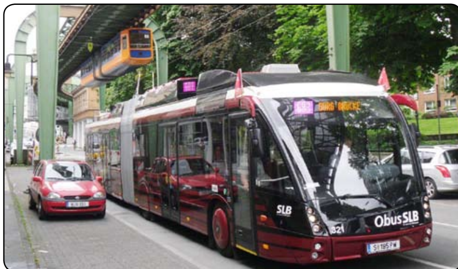
Trollino MetroStyle from the TROLLEY partner city Salzburg visiting the German trolleybus city Solingen/Wuppertal

The TROLLEY Knowledge Center is integrated into the website of the TROLLEY partner trolley:motion – an international action group to promote e-bus systems with zero emissions - and is available via http://www.trolleymotion.ch .