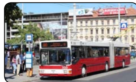
MAN/G&S articulated trolleybus 350, previously Eberswalde, since 15 June 2012 operating in regular service on bus route 80

buses could be kept low, the purchase was made at € 38,000 per vehicle, plus transfer cost of € 8,700 and costs for overhaul and adaptation to Hungarian conditions amounting to € 54,000. Including duties, the total price per vehicle is € 103,000. These are the first low-floor articulated buses for Budapest, so far only solo vehicles were purchased in the low-floor variant. Furthermore, the new vehicles are more energy-efficient than the previous 99 articulated trolleybuses, which were procured from 1987 until 1996. A decrease in energy